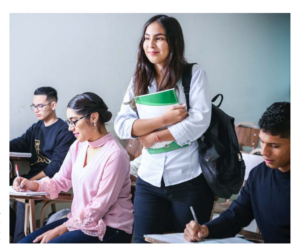
Right: The WCCS works to broaden access to careers in the property sector

We are keen to improve access to equal opportunities in the surveyor and real estate industry, and hope that this programme, and others like it, will help to attract a broader range of talented people into the sector.