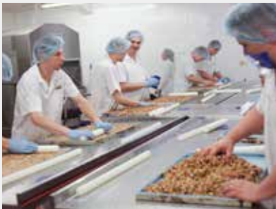
Wholebake, Bridges Sustainable Growth Fund III

Bridges UK and US Sustainable Growth Funds provide mission-aligned capital for high-growth businesses that are creating impact through what they do, how they do it or where they're located. Through these funds, we have been able to prove to a range of investors that impact really can be an engine of value.