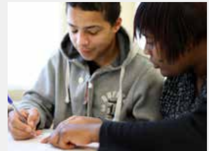
Community Links, Bridges Social Impact Bond Fund

These funds provide financial and operational support to social sector organisations delivering services with high societal impact. The Social Entrepreneurs Fund helps fast-growing enterprises to scale, while the Social Impact Bond Fund, the first of its type in the world, provides up-front capital and support for those delivering outcomes-based contracts.