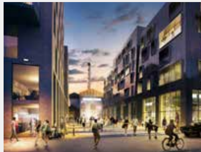
The Old Vinyl Factory, Bridges Property Alternatives Fund III

Our property funds seek out investment opportunities where creating social or environmental value – by unlocking the potential of emerging locations, or improving the energy footprints of buildings, or building high-quality care homes for the elderly, for example – also allows us to unlock significant financial value for investors.